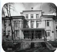
Figure 1 Structure of a paediatric polyclinic in Russia.

institutions. Medical examinations of children are carried out directly at schools and kindergartens.