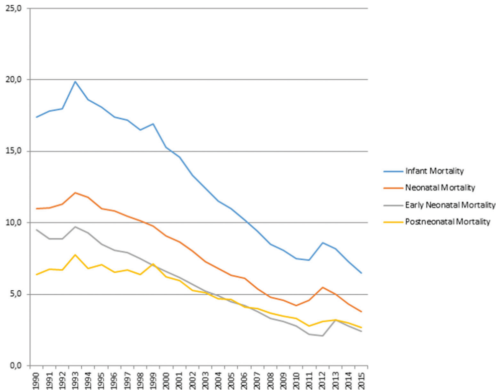
Figure 3 Infant mortality in Russia (per 1000 live births).