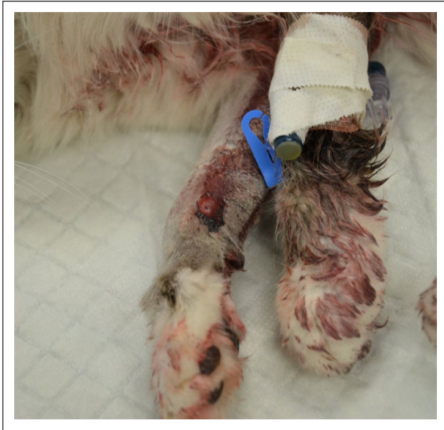
Figure 1 Puncture wound on the right antebrachium of a cat with active hemorrhage due to persistent pit viper envenomation