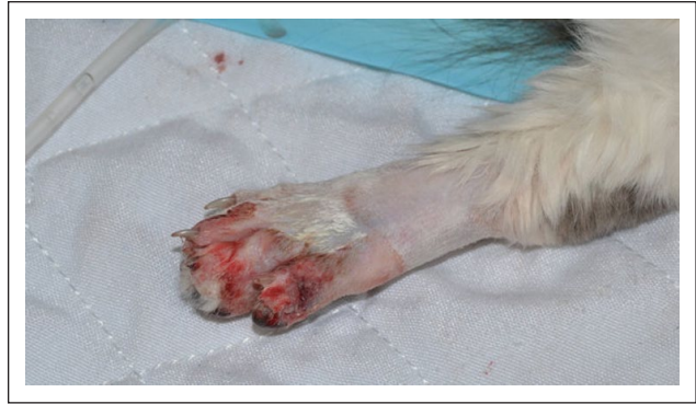
Figure 2 Puncture wound on the fifth digit of the left pelvic limb of a cat with active hemorrhage due to persistent pit viper envenomation

On physical examination, the cat was obtunded and in lateral recumbency. It had weak femoral pulses, pale oral mucous membranes, sinus tachycardia, tachypnea and hypersalivation. There was active hemorrhage from the puncture wounds and hemorrhage in the surrounding soft tissues on the right antebrachium and the fifth digit