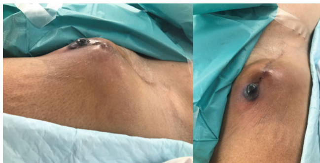
FIGURE 1: Infected pseudoaneurysm in the left groin.