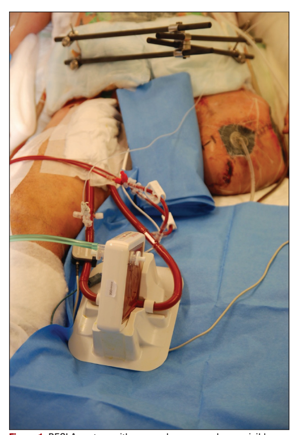
Figure 1. PECLA system with gas exchange membrane visible, along with ultrasound chip for measurement of blood flow.

The best indication is severe hypercapnia and moderate hypoxia.9 About 1-2 L/min are bypassed into the PECLA circuit. In our center, the PECLA membrane oxygenator (Novalung GmbH, 72379 Hechingen, Germany) is used on intensive care wards as well as for patient transport. The necessary priming volume is low (300 mL). Cannulas (NovaPort, Novalung, Hechingen, Germany) are placed via the Seldinger technique into the femoral artery (15-17 Fr) and femoral vein (17-19 Fr) (Figure 1). ECMO (extracorporeal membrane oxygenation) is a veno-venous extracorporeal bypass procedure used during severe global respiratory failure, such as acute respiratory distress syndrome, where cardiac pump function is not essentially affected. Via extracorporeal lung support sufficient gas exchange is created to treat critical hypoxemia and hypercapnia. The blood is drained from the inferior vena cava and diverted into the superior vena cava by a centrifugal pump (3-4 L/ min). Lung protective ventilation may be added during extracorporeal gas exchange but is not essential. ECLS (extracorporeal life support) is a veno-arterial bypass procedure for emergency cardiopulmonary situations.