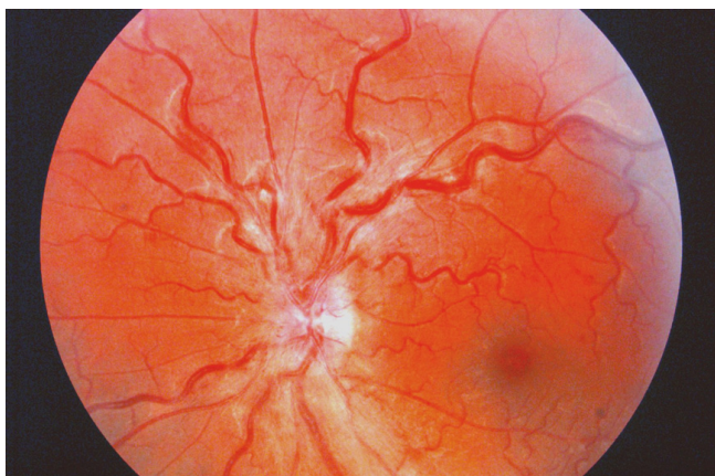
Figure 1 Funduscopy image of the left eye. Fundus photograph of the patient's left eye with optic disc oedema, retinal haemorrhages and engorged, tortuous veins. Photograph taken on the day of presentation.

A detailed clinical investigation of all systems, including cardiovascular and neurological assessment was unremarkable. Total blood count with differential, erythrocyte sedimentation rate (ESR), C-reactive protein (CRP), and routine laboratory testing were within normal ranges, except for a mild increase in low-density lipoprotein (LDL) cholesterol that was attributed to isotretinoin use. Urine analysis and 24-hour urine selection specimens were within normal ranges. Moreover, no viral or other