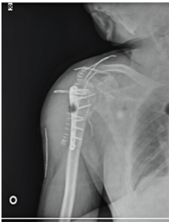
Figure 2 Procedure of surgery.