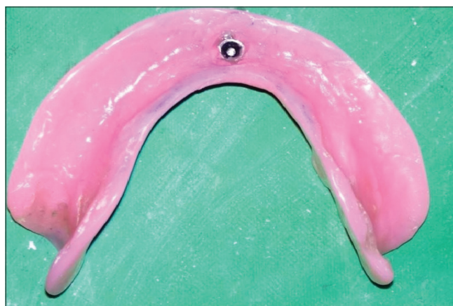
Figure 2: Nylon cap with metal housing picked up in denture using self-cured acrylic