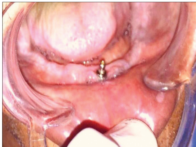
Figure 1: Implant with ball abutment after 3 months of implant placement

Friedman test was done to analyze the satisfaction questioners response which showed significant improvement in ( P < 0.05 ) subjective satisfaction (oral comfort and prosthesis function) and a significant decrease ( P < 0.05 ) in complaints from pretreatment (control group) to all