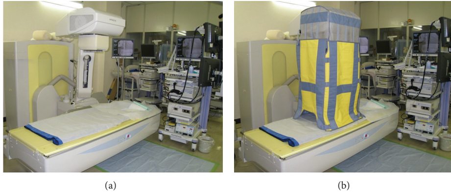
FIGURE 1: X-ray fluoroscopy generator and protective lead shield. (a) Without protective lead shield. (b) With protective lead shield.

practice. In this study, we assessed the level of occupational radiation exposure during ERCP and measured the radiation doses to staff members when a protective lead shield was used and was not used during ERCP to assess the effectiveness of the shield.