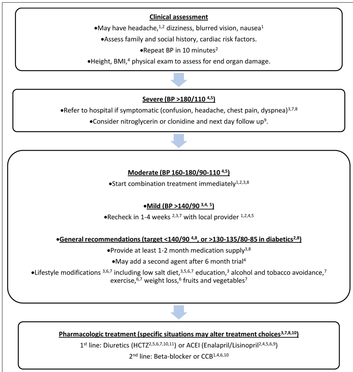
Figure 2: Most common recommendations for management of hypertension in short-term, primary care MST settings in Latin American and Caribbean, compiled from a composite of protocols from 20 NGOs.

electrolyte abnormalities) [8, 9, 10]. Furthermore, NGOs should consider patient education initiatives that emphasize safe medication use, and encourage clinicians to confirm that a patient starting pharmacologic therapy has the financial and logistic means to continue that therapy.