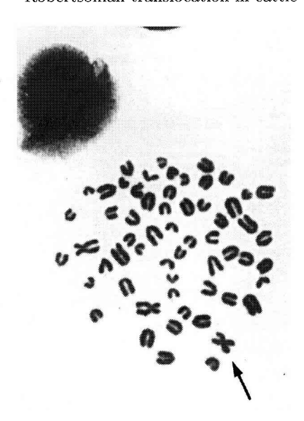
Fig 1. Giemsa-stained metaphase showing an unusual metacentric chromosome (arrow).