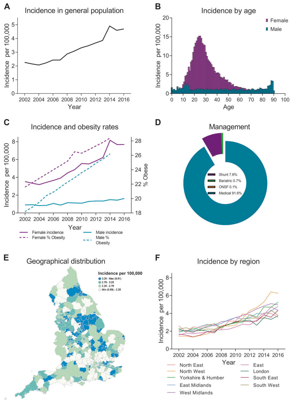
Fig. 2 Composite figure. a Incidence in the general population. b Incidence by age and gender. c Annual incidence in females and males and Obesity rates (% obesity per annum (body mass index \geq 30 ), age-standardized in 18 years + by gender in the United Kingdom. From World Health organisation http://apps.who.int/gho/data/node.main.A900A?lang=en Accessed 6 Oct 2017. d Management of IIH in the cohort. e Geographical distribution of diagnosed cases of IIH in England. f Distribution of cases by region per annum

The relationship between IIH and social deprivation varied with gender, with female cases significantly correlating with deprivation r = 0.89 , p < 0.001 , but this was not apparent in male cases ( r = 0.37 , p = 0.539 ) (Fig. 3a). BMI is known to differ with deprivation quintiles [17], and here amongst the female IIH population, cases correlated with deprivation quintile BMI ( r = 0.98 , p = 0.003 ), however male gender did not ( r = 0.59 , p = 0.291 ) (Fig. 3a).