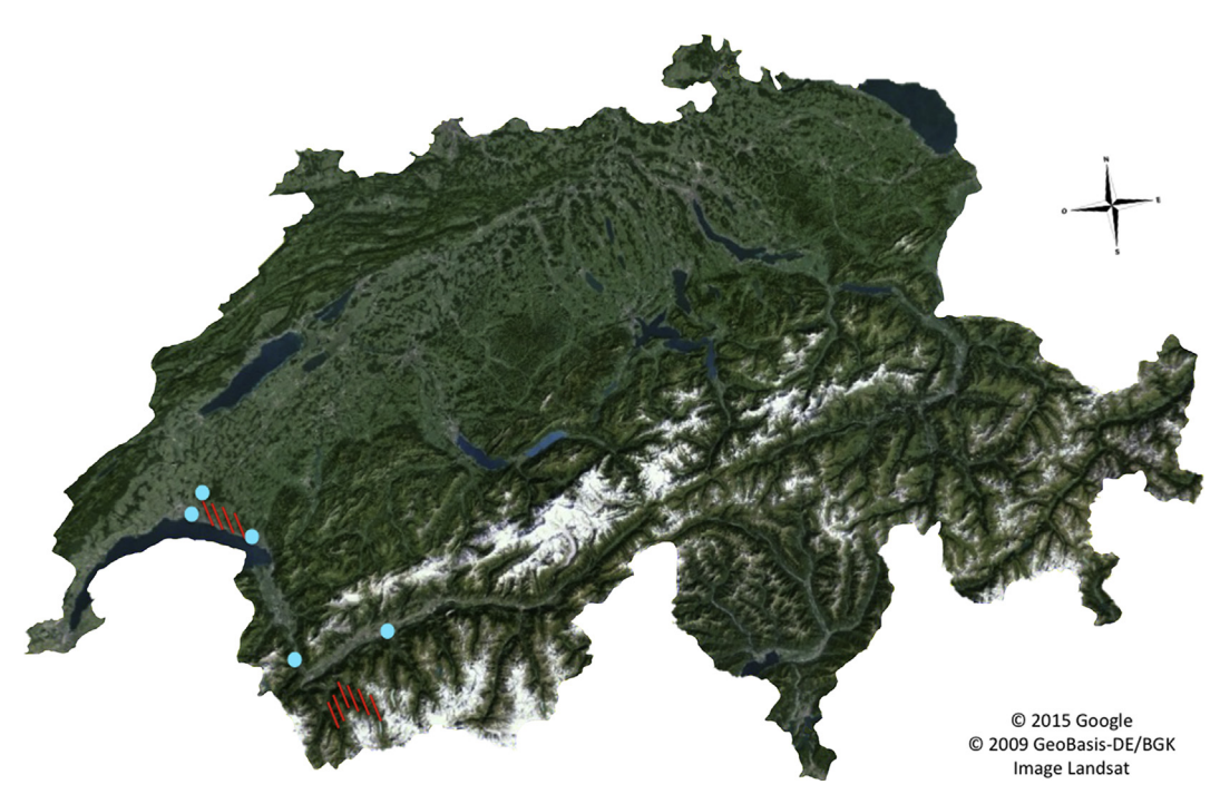
FIG. 2. Absence of positive tick samples for presence of Coxiella burnetii DNA in Switzerland. All 8534 pools were negative for presence of C. burnetii DNA, even in collection sites (blue dots) located near area where two Swiss Q fever outbreaks occurred (red lines).

keep monitoring for the presence of this pathogen in ticks and in wild and farm animals.