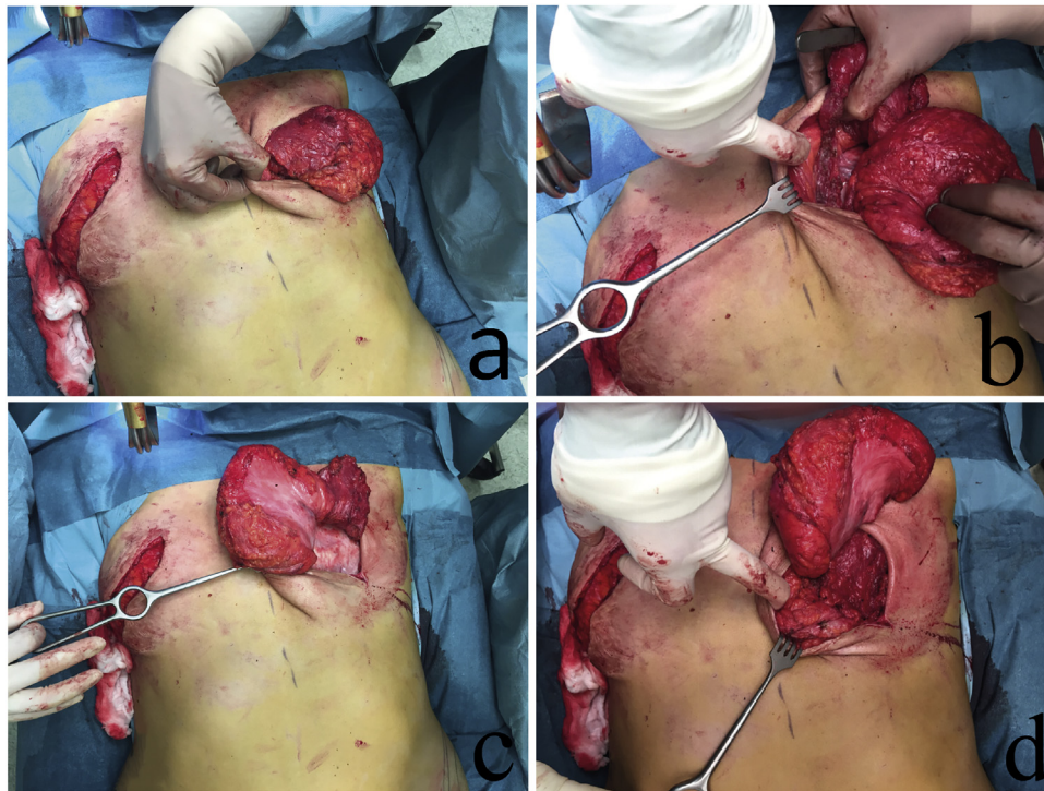
Fig. 1. The surgical technique step-by-step, including dividing the skin from the pectoralis major muscle (1a), dividing the insertion of the pectoralis major muscle from the sternum (1b), repositioning the pectoralis major muscle under the DIEP flap (1c), and reattaching the pectoralis major muscle to the sternum (1d).