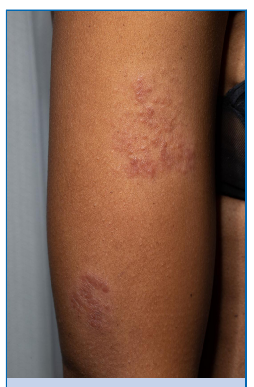
FIGURE 6. Plaque sarcoidosis as a cutaneous manifestation seen on the upper arms. Multiple erythematous plaques are evident.

occurs in 5% to 15% of patients. True inflammatory arthritis is seen more frequently than just arthralgia. 7,10,12,18 Joint pain is usually one of the first symptoms that eventually leads to the diagnosis of sarcoidosis. The typical presentation is acute oligoarthritis with involvement of the large joints, especially the ankle joint (in over 90% of cases). Polyarthritis with involvement of the small joints of the hands is seen very infrequently. In these patients, other systemic arthritides such as rheumatoid arthritis, which can even co-occur with sarcoidosis, must be considered first. Erythema nodosum accompanies arthritis in approximately 25% to 30% of cases.<sup>28,29</sup> Chronic arthritis is extremely uncommon. Resolution of the inflammatory arthritis usually occurs within 6 weeks in most patients and within 2 years in almost all patients. 20,28,29 Enthesitis (especially Achilles tendinitis) can also be found in patients with sarcoid arthropathy; the prevalence is about 5% to 8% <sup>28,30</sup>