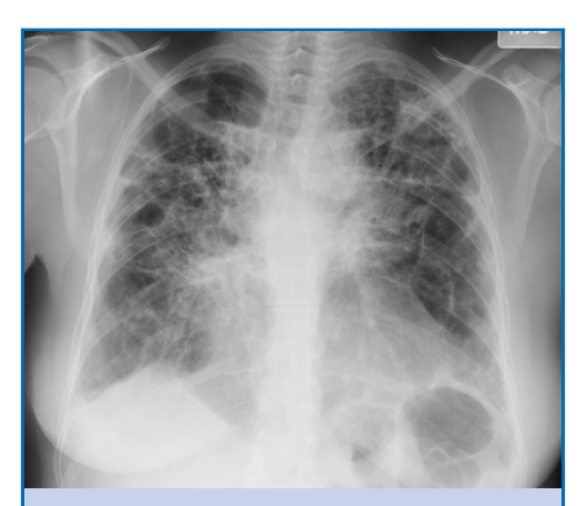
FIGURE 4. Chest radiograph of a 54-year-old woman with stage IV pulmonary sarcoidosis, demonstrating extensive parenchymal scarring throughout both lungs, most marked in the upper lungs and in the perihilar regions.

mass and optic neuritis, nonuveitis ocular sarcoidosis tends not to affect visual acuity, and the response to treatment is generally very favorable. The conjunctiva and lacrimal gland may also serve as easier to reach targets for biopsy when they are involved.<sup>24,26</sup>