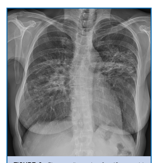
FIGURE 2. Chest radiograph of a 62-year-old woman with stage II pulmonary sarcoidosis, demonstrating bilateral nodular parenchymal opacities in a perihilar and mid-lung distribution associated with bilateral hilar and aortopulmonary window lymphadenopathy.

Eyes. Ocular sarcoidosis is the second most common extrathoracic manifestation of this disease. The reported prevalence of ocular involvement ranges from 10% to 25%, with a higher prevalence observed among blacks