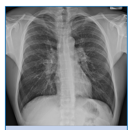
FIGURE 1. Chest radiograph of a 31-year-old man with stage I pulmonary sarcoidosis, demonstrating bilateral hilar lymphadenopathy without evidence of parenchymal lung involvement.

Eyes. Ocular sarcoidosis is the second most common extrathoracic manifestation of this disease. The reported prevalence of ocular involvement ranges from 10% to 25%, with a higher prevalence observed among blacks