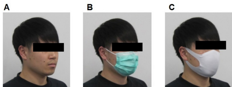
Fig 1. Three facemask conditions. Each participant underwent progressive treadmill tests under 3 conditions: without a facemask (A), wearing a surgical facemask (B), and wearing a cloth facemask (C) in randomized order. Both types of facemasks are widely used in hospitals and gyms as well as in daily life in Japan.

Fifteen healthy male and 9 healthy female volunteers participated in the study. Written informed consent was obtained from all participants after providing oral and written explanations of the experimental procedures and associated risks. Participants with cardiac or pulmonary diseases or any other medical contraindications were not included. Mean demographics of the participants were as follows; age 21.0 \pm 0.8 years, height 165.1 \pm 7.1 cm, bodyweight 59.3 \pm 7.7 kg, and body mass index 21.7 \pm 2.3 kg/m 2 . Pulmonary function parameters measured with a spirometer (AS-507, Minato Medical Science, Osaka, Japan) were: vital capacity