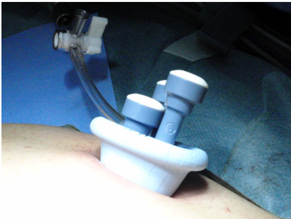
Figure 3 Intraoperative photograph of SILS port placed in umbilicus.