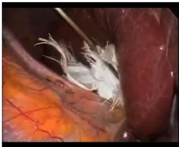
Figure 6 The liver is lifted using gauze and a miniport forceps. 4b Longer hook for Opti4 laparoscopic electrode.