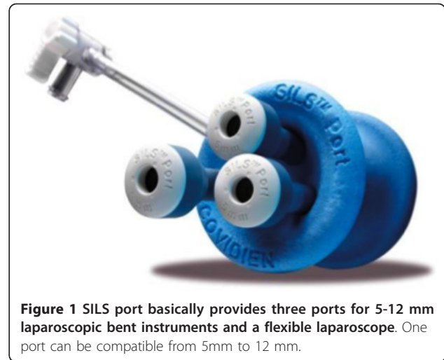
Figure 1 SILS port basically provides three ports for 5-12 mm laparoscopic bent instruments and a flexible laparoscope. One port can be compatible from 5mm to 12 mm.

The multichannel port (SILS port, Figure 1), bent laparoscopic instrument (Roticulator Endo Mini-Shears, Figure 2) and Opti4 laparoscopic electrodes were supplied by Covidien (Mansfield, USA). Ultrasonic scalpel (SonoSurg) was supplied by Olympus Surgical (Tokyo Japan). In all cases of LESS-A, we approached the intraperitoneal space through the umbilicus. The SILS port was placed through a 2 cm incision at the inner edge of the umbilicus (Figure 3). The anterior rectus fascia was sharply incised, and four corner fascial stay sutures were placed. A 5 mm flexible laparoscope (Olympus Surgical, Tokyo, Japan) was introduced to keep the laparoscope outside the port in a location away from the surgeon's instruments to avoid instrument contact and maximize surgical movement. Bent instruments were required to create the operative angle because the insertion points