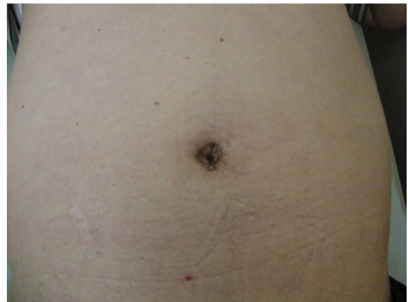
Figure 5 Postoperative photograph of skin incision of a patient who underwent right adrenalectomy.

can be traumatic for the liver. To avoid traumatic procedure, we used a small gauze or Securea sponge (Hogy, Tokyo) as cushioning to lift the liver (Figure 6). In all cases of LA, we placed 3 or 4 ports into the intraperitoneal space in an usual fashion, and performed adrenalectomy by using rigid straight laparoscopic instruments and a rigid laparoscope under pneumoperitoneum.