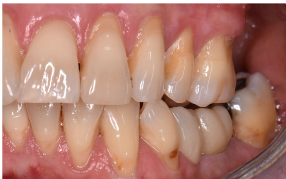
Fig. 1 Clinical case of a cantilevered 2-unit FDP (lateral view). The implant is placed in position 36, the cantilever pontic in position 35

To calculate changes in marginal bone level, a digital peri-apical radiograph was taken using a paralleling technique with an x-ray holder, immediately following implant placement (baseline) and at the follow-up evaluation.