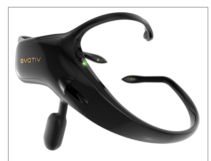
FIGURE 2 | The asymmetric Emotiv Insight Headset. Reproduced with permission.

donned the Emotiv Insight (see Figure 2 ) and the other half the InterAxon Muse EEG Headsets. Data of the Muse Headset had to be discarded due to problems with data collection. We opted to test a second cohort using the Emotiv Insight to systematically increase the sample size.