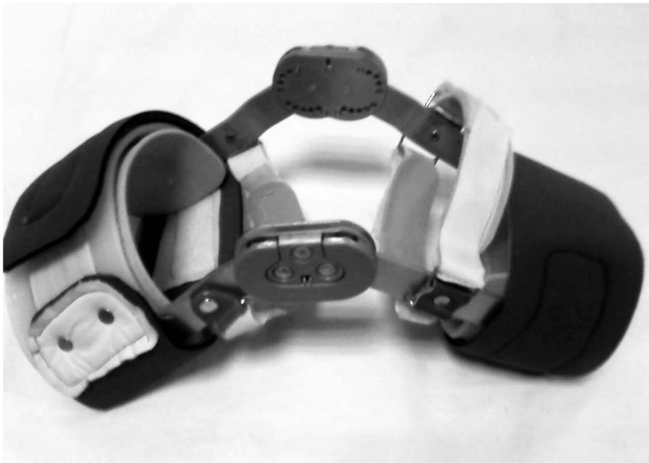
Figure 1. Functional knee brace. doi:10.1371/journal.pone.0064308.g001

extension and flexion torques (respectively more than 3% and 10%), although none of the above differences were statistically significant ( P>0.05 ). Peak torques comparisons showed no significant differences when they were compared between braced conditions. (Table 1)