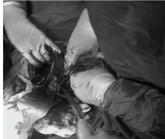
FIGURE 3: Two incisions were repaired separately.

There are no guidelines about the followup of the pregnancy or selecting the mode of delivery, because the incidence is very low [7]. To date, there are only 12 reported cases of twin pregnancy in bicornuate uterus [7–11]. Mode of delivery could be abdominal or vaginal. However, dystocia,