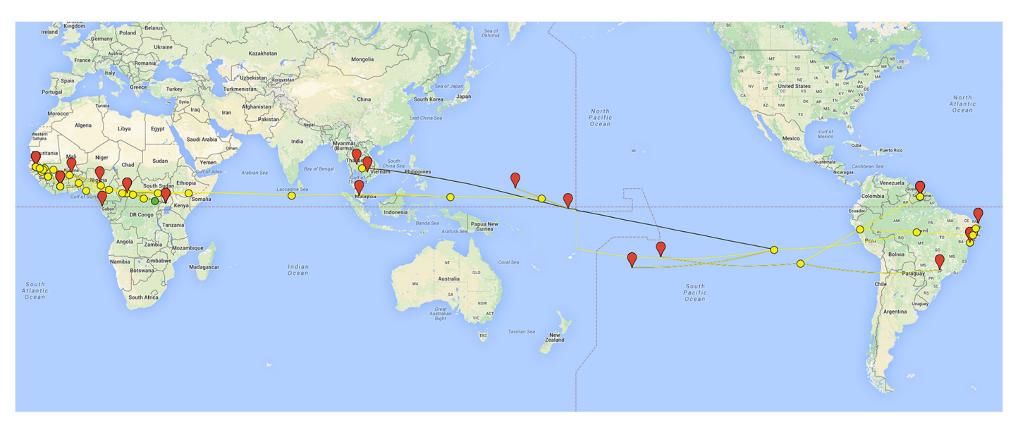
Fig 1. Phylogeographic analyses illustrating the lineage of the Zika virus currently circulating in Brazil. Phylogeographic analysis based on the envelope gene of Zika virus. This analysis illustrates the path of travel of Zika virus from Africa, Asia, and across the Pacific to South America. This analysis was created with Supramap [68]. Yellow circles and branches are associated with common ancestors. Red pins and black lines are associated with observed viral isolates. The root of the tree is indicated with a green circle. Data analyzed included all envelope variants of Zika virus available in the public domain as of January 18, 2016. Nucleotide sequence data were aligned using MAFFT v7.215 under default settings. A dataset for the envelope gene was created resulting in a matrix of 56 taxa and 753 aligned positions. A phylogenetic tree search was conducted for each dataset using RAxML v8.1.16 for 100 replicates under the GTRCAT model of nucleotide substitution. The outgroup was set to HQ234498. Supramap to project the phylogenetic tree into the earth [68].