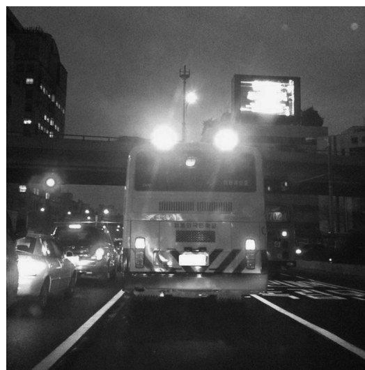
Figure 3 A school bus warning light could function as a flashlight-guidance cardiopulmonary resuscitation device.

There are several limitations to our study. First, we used mannequins as models to simulate an emergency resuscitation situation. This simulation could not reproduce the real nature of emergency situations. Second, laypeople can be confused by additional visual CPR-guidance stimuli in noisy environments. Flashlights that are too bright or of certain colours may have a disturbing effect. Application of flashlight guidance may increase the complexity of CPR, thus delaying its initiation by