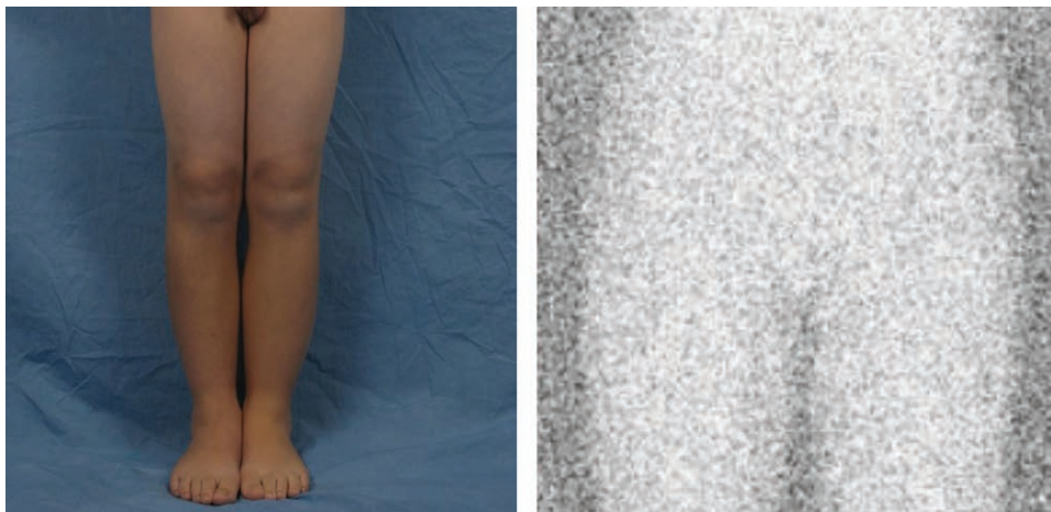
Fig. 1. True-positive lymphoscintigram result. An 11-year-old boy with a history and physical examination consistent with primary lymphedema. Lymphoscintigraphy confirmed the diagnosis and showed absence of tracer in the inguinal nodes 4 hours after injection (normal transit time is less than 1 hour).

The term “lymphedema” often is used generically to describe patients with an enlarged extremity, regardless of the etiology of their condition. 1,2 Lymphedema is managed with counseling regarding activities of daily living (e.g., infection prevention), compression regimens, and operative interventions. 3–10 Lymphedema usually can be diagnosed by history and physical examination. Characteristic findings include a family history of the disease, axillary/inguinal radiation, lymphadenectomy, travel to areas endemic for filariasis, or extreme obesity (body mass index > 50). Primary lymphedema affects 1/100,000 individuals 11 ; men usually have bilateral lower extremity swelling during infancy, and women typically present with unilateral limb enlargement in adolescence. 5 Secondary lymphedema accounts for > 99% of lymphedema cases; swelling typically begins 12 months after the injury to lymph vessels. 12 Pitting edema almost always affects the distal limb and later