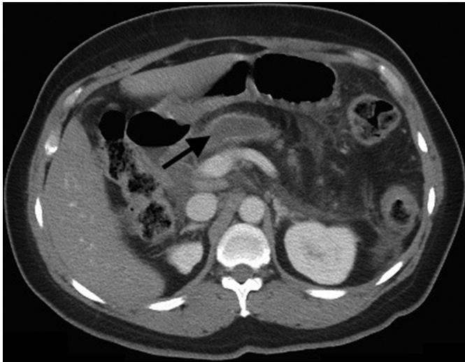
Figure 1. Computed tomography demonstrating severe dilation of the pancreatic duct.

The patient's sepsis resolved, and she was discharged with 10 days of oral antibiotics. In total, she received 22 days of antibiotics. She underwent a repeat ERCP 30 days later, during which the indwelling stent was removed and 2 straight plastic stents (7 Fr x 8 cm and 5 Fr x 8 cm) were placed adjacent to one another.