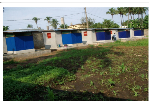
Figure 1 Experimental huts, Akron station. (September 2007).

A 10 cm wide moat filled with water surrounded each hut to prevent the entry of scavengers such as ants and spiders. Six identical huts were built at the station. Five huts were treated with insecticides using a backpack sprayer and the sixth was left untreated as a control. The absorption of the walls was 112 ml of insecticide per m 2 and that of the ceiling (polyethylene), the entry slits, and the door (painted metal) was in total 53.13 ml/m 2 . The area of the walls to treat was 15 m 2 and that of the roof, the doors, and the entry slits was 5.1 m 2 . To treat the walls of the huts, 1.7 L of water was used. For the rest of the huts, 270.8 ml of water was used. Using these measures, the five huts were treated according to WHO recommendations [19];