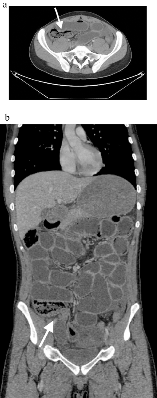
Fig. 1. A and B: CT scan of the abdomen demonstrating dilated small bowel, transitional zone of the obstruction, and evidence of pneumatosis intestinalis.