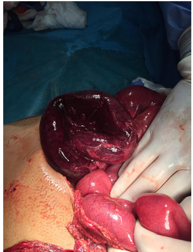
Fig. 3. Ischemic segment of the terminal ileum, Laparotomy.

and an ileocecectomy was performed (Fig. 3). During the procedure, approximately 20 cm of distal ileum was herniated through the superior ileocolic recess and were twisted along its mesentery. An ileocecectomy with a side to side primary anastomosis using a 75 GIA stapler was performed. The postoperative course was uneventful and the patient was discharged from the hospital on the 8th postoperative day.