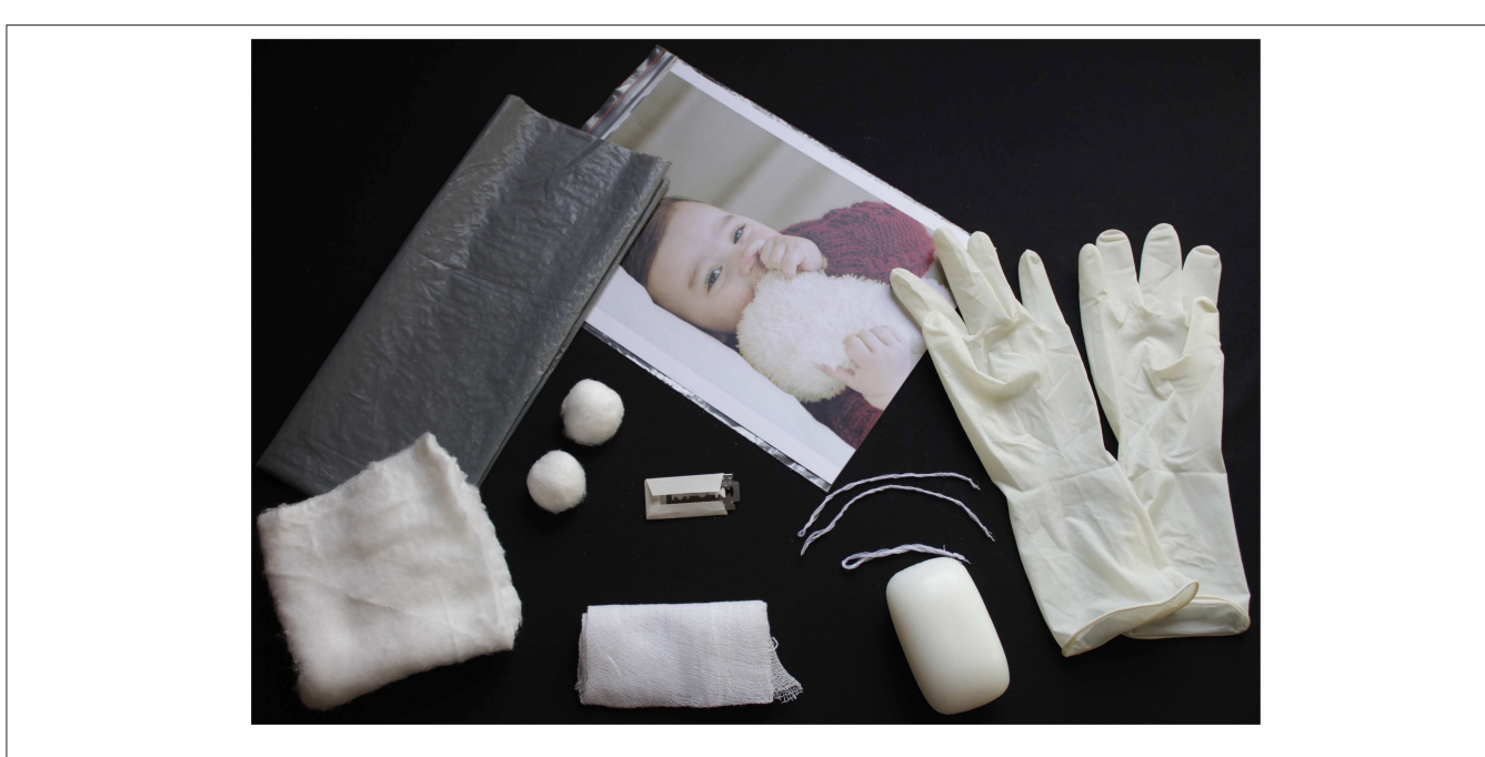
FIGURE 3 | Contents of Clean Delivery Kit to ensure clean delivery practices that includes plastic delivery sheet, a soap, blade, cord ties/ligand, spirited gauze, and, additionally, gloves.

emphasized for centuries from times of Ancient Greeks and from texts of Avicenna (35). One of the best examples in this regard is the case of child-bed fever or "puerperal sepsis" realized by nineteenth-century Hungarian physician Ignaz Semmelweis, when he demonstrated that an approach as simple as "cleaning hands" could prevent totally unnecessary deaths of mothers during delivery. The epidemic nature of infectious causes of maternal and neonatal deaths and its prevention through clean delivery practices was realized however much later after Semmelweis's death in 1865 (35, 36). Many decades later, in 1998, WHO published a review of evidence for care of umbilical cord and summarized clean delivery and cord care practices as "six cleans" (37).