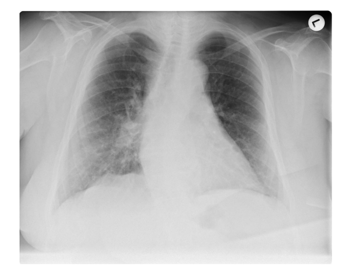
FIGURE 2 Posteroanterior chest radiographs, 19 March 2020 (hospital day 3)

problems had occurred early in the infection with a 24 to 48 hours median period to hospital admission.<sup>7</sup> Of note, respiratory failure in some infected individuals may be partially attributed to SARS-CoV-2 neuroinvasion.<sup>8</sup> Patients with severe SARS-CoV-2 may have hypoxia, metabolic and electrolyte imbalance, and multiorgan failure.<sup>3</sup> Thus, it is expected that subsequent clinical or subclinical seizures and status epilepticus may develop in these patients.<sup>16</sup> Therefore, it is substantial to monitor patients with a critical condition using continuous EEG to avoid delayed diagnosis of seizures.