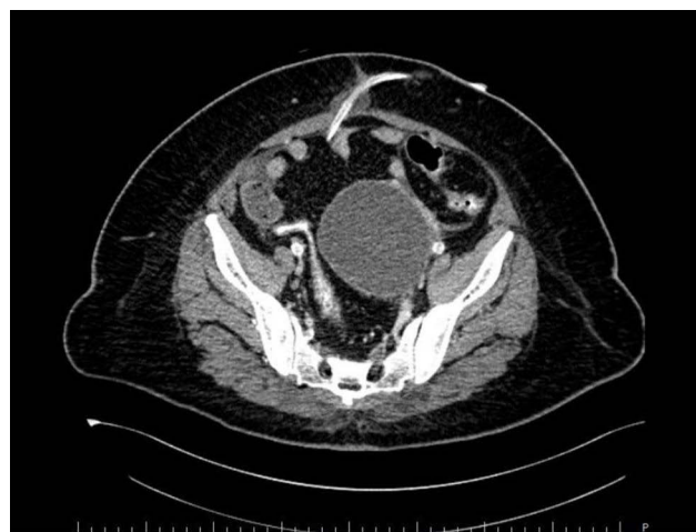
Figure 1 CT scan of the pelvis findings.

Intraoperatively, there were no intraperitoneal adhesions noted in the abdomen or pelvis. There was a large