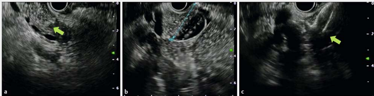
► Fig. 1 Ultrasonographic view of the lesion. a Hypoechoic lesion infiltrating the biliary tract. b Dilated bile duct. c Endoscopic ultrasound-guided choledochoduodenostomy.