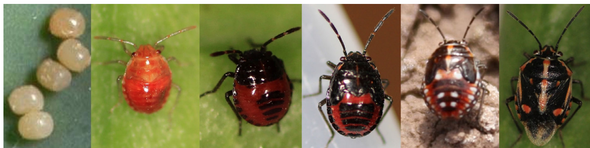
Figure 1: Life stages of the Bagrada bug.