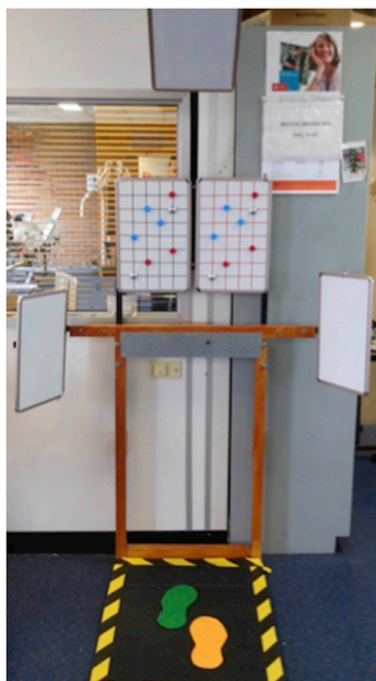
Fig. 3. Static balance dual-task apparatus - The custom-made apparatus, affectionately named 'Humphre' - consists of coloured button magnets, and magnetic whiteboards laterally, in front, and above the participant to allow completion of physical and cognitive dual-task. A grab bar in front of the participant provides additional support during the movement.