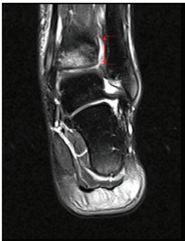
Figure 2. Measurement of height of fluid within syndesmosis (red arrow and lines). Coronal T2-weighted fat-saturated magnetic resonance image from a patient in the syndesmosis injury (SI) group.