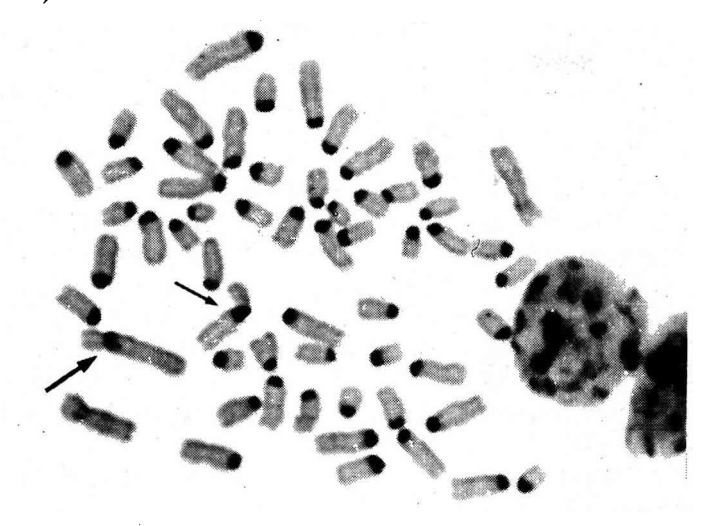
Fig. 3. CBG-banded metaphase showing constitutive heterochromatin as one block in the 1/29 translocation (large arrow) and two blocks in the 9/23 translocation (small arrow).

cation which does not confer any advantage to heterozygous carriers, produces in certain breeds a reduced fertility in the daughters of carrier bulls (Gustavsson, 1969; Refsdal, 1976).