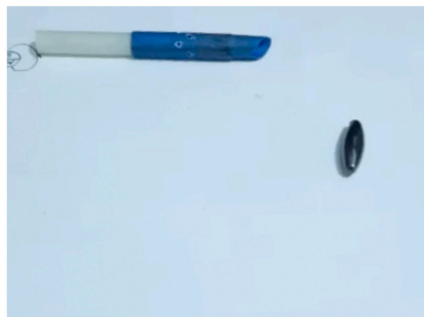
Fig. 3. The hand-made magnetic instrument.

associated with less catastrophic complications, AFBs usually present with respiratory signs requiring immediate intervention. It is estimated that the mortality rate in these cases may reach up to 7 % between 0 and 3 years. Moreover, it has been reported that this problem is more common in male children [4].