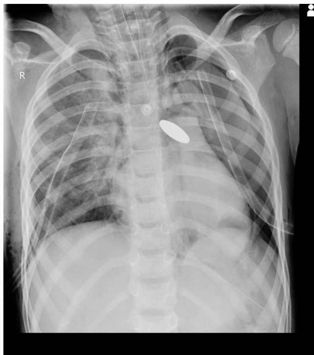
Fig. 2. X-ray demonstrating the migration of entrapped magnet to the left main bronchus. Bilateral thoracostomy tubes are visible. Note the significant hyperlucency on the left side.