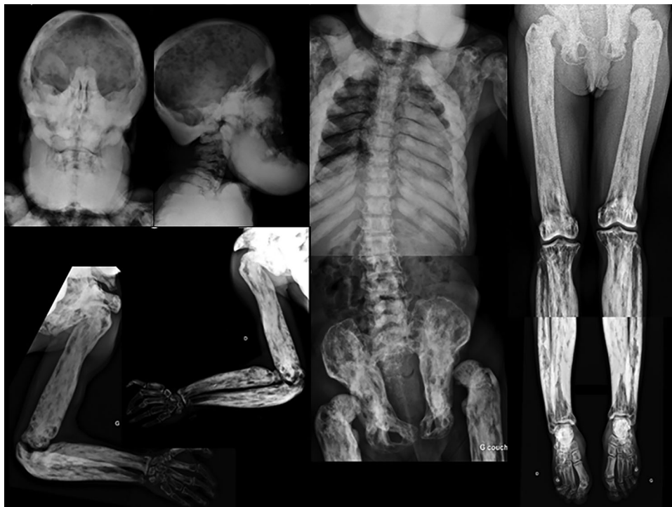
FIGURE 5 Skeletal survey of patient 2. The patient has generalized hyperostotic dysplasia, an enlarged mandible, shortened broad ribs, bilateral hip dislocation, cortical thickening of the long bones, very short metacarpals and symphalangism by fusion of proximal and intermediate phalanges of 2nd to 5th ray, similar to those observed in patient 3 (not shown)

reported by Sousa et al. (2014). Since then, two further LMS patients have been described, with mutations in exon 7 (Tamhankar et al., 2015; Whyte et al., 2015). This means that LMS is a very rare disease with our description here of the novel c.284G>T; (p.Arg95Leu), and c.806C>T; (p.