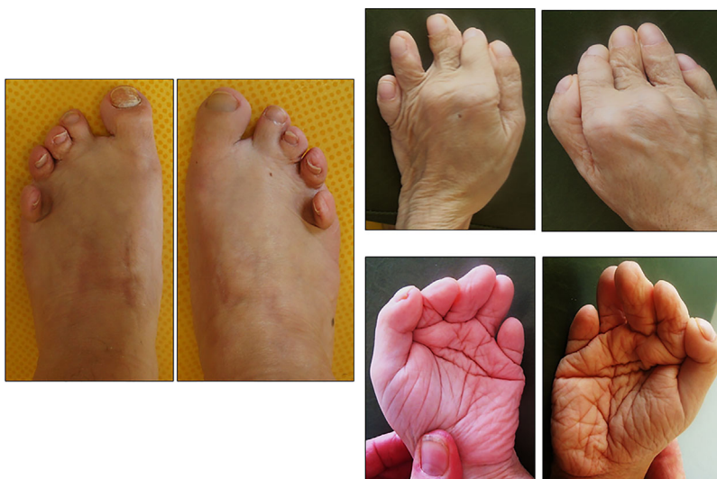
FIGURE 4 Patient 2: Hands and feet showed short toes and fingers, sandal gaps, deep palmar creases, and hands acrogeria with skin wrinkles. [Color figure can be viewed at wileyonlinelibrary.com ]

Sousa et al. (2014) identified causative heterozygous missense de novo mutations in PTDSS1 in five unrelated LMS-affected patients. The c.1058A>G; (p.Gln353Arg) mutation in exon 9 was identified in three previously described patients while two new cases harbored c.794T>C; (p.Leu265Pro) and c.805C>T; (p.Pro269Ser) mutations in exon 7. The p.Leu265Pro mutation corresponds to patient 1 in this report, while patient 3 in this report has c.806C>T; (p.Pro269Leu) resulting in a different amino acid substitution at the same Pro269 position to another LMS patient