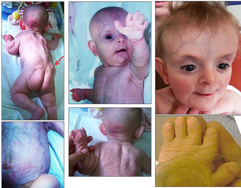
FIGURE 1 Photographs of patient 1 at 6 months (left panel, middle panel, hand) and 18 months (upper right photograph) showing cutis laxa, prominent veins, lipodystrophy (arrow), brachydactyly and facial dysmorphism. [Color figure can be viewed at wileyonlinelibrary.com ]

those of the 4th and 5th fingers, a bilateral overdevelopment of the 1st ray proximal phalanx and the fusion of proximal and intermediate phalanges of 2nd to 5th ray was observed.