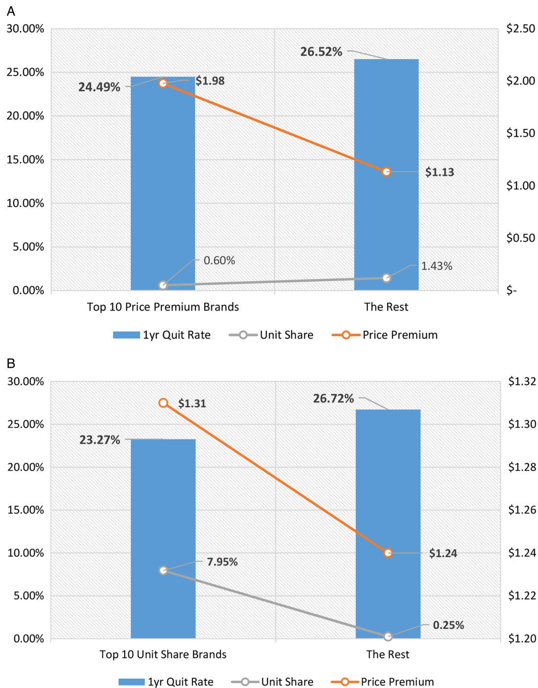
Figure 1 One-year quit rate comparison in (A) the top 10 price premium brands versus other brands and (B) the top 10 unit share brands versus other brands.