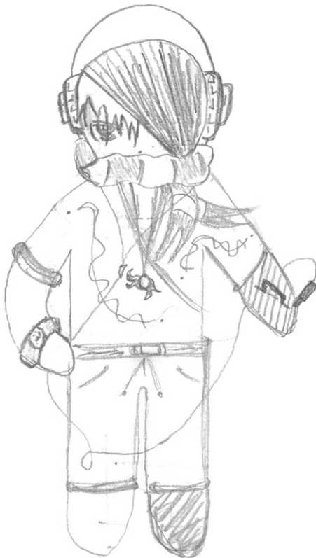
Fig. 2. Self-portrait drawn by A. He explained that the bandages on the left hand and foot indicated that he was “broken”.

To resolve the resultant conflict between insecurity with his performance, fear of failure, and high expectations of himself, A. actively