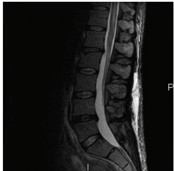
Figure 3 Thoracic-lumbar spine MRI with gadolinium enhancement. There is increased signal in the spinal cord and lumbosacral roots on sagittal view.

A Gadolinium magnetic resonance imaging (MRI) of his spine was done to rule out spinal cord compression; it revealed abnormal spinal cord signal intensity involving several cervical and thoracic segments, associated with expansion of the cord and mild enhancement of the areas of abnormal T2 signal (Figure 3). MRI of the brain revealed a few patchy areas of abnormal T2 signal in the peri-ventricular and pontine white matter.