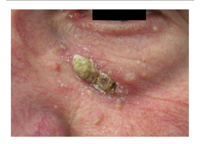
Fig. 2. The 2.0\times1.0\,\mathrm{cm} mildly erythematous thin plaque with a yellow crust.

pseudoepitheliomatous hyperplasia and a few yeast with narrow-based budding suggestive of H. capsulatum. Urine testing for H. capsulatum antigen was negative. This lesion resolved within 2 weeks without medical intervention. Chest radiographs revealed small minimally calcified lymph nodes in the inferior right hilum and subcarinal chain (Fig. 1). One year later, the patient presented with recurrence of the lesion as a 2.0×1.0 cm thin, irritated, erythematous and crusted plaque (Fig. 2). No preceding trauma nor recent change in health status nor medications were reported. A full-skin examination demonstrated no similar lesions. Repeat biopsy was performed and showed findings similar to those previously described; however, numerous yeast forms were noted in this specimen (Fig. 3a, b). The organisms were highlighted by periodic acid-Schiff (PAS) and Grocott-Gomori methenamine silver (GMS) stains (Fig. 3c, d). Negative Fontana-Masson and mucicarmine stains excluded the presence of a