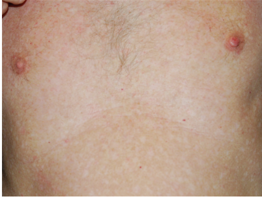
FIGURE 1: Enlarged left nipple. Clinical appearance of BCC on the left nipple. Erosion on the surface represents the biopsy site.