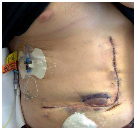
FIGURE 1: Patient with "J" incision and right-sided quadratus lumborum catheter. Left-sided catheter not shown in figure.

After closure of the right abdominal "J" incision and prior to emergence, ultrasound-guided QLC were placed bilaterally (Figure 1). A linear ultrasound transducer was placed in the anterior axillary line and moved posteriorly until the posterior aponeurosis of the transversus abdominis muscle became visible (Figure 2). In this lateral QL block (QL type 1), a 17-gauge Tuohy needle was utilized to thread a nerve catheter into the fascial plane. The Tuohy was inserted from the anterior end of the transducer and advanced until this aponeurosis was penetrated (Figure 3). Dissection with sterile saline confirmed the location, and after threading the catheter, 5 mL of 0.5% bupivacaine with 1 : 200,000 epinephrine was injected through the catheter between the aponeurosis and the transversalis