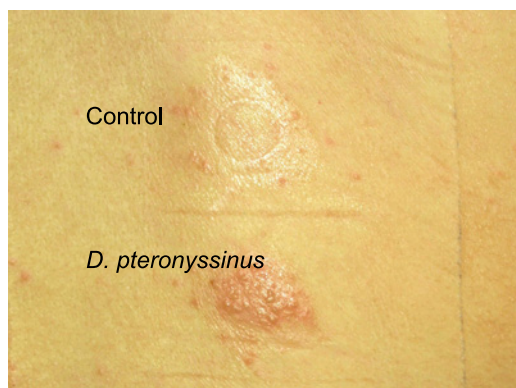
Allergen 200 IR/g in petrolatum

Allergen concentrations of 500, 3000, 5000, and 10,000 protein nitrogen units (PNU)/g in petrolatum were compared in another study 56 in 57 patients. The frequency of clear-cut positive APT reactions was significantly higher in patients with eczematous skin lesions in air-exposed areas (69%) as compared with patients without this predictive pattern (39%; P = 0.02 ). In the first group, the maximum APT reactivity was reached at a lower allergen dose of around 5000 PNU/g.