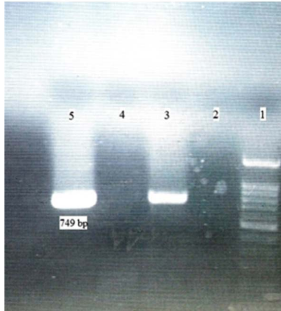
Fig. 1. The result of PCR amplification for verification of VP7 segment of human Rotavirus RV4 strain (G1P8), lane (1) 100 bp DNA ladder (CinnaClon), lane (2) negative control, lane (3) PCR positive control (749 bp), lane (4) negative PCR result for segment 7& 8, lane (5) positive PCR result for segment 9 (749bp).