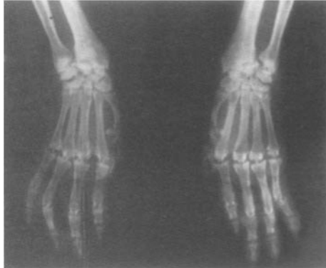
FIGURE 2. Radiograph of the wrists and hands of a monkey 3 mo after immunization with type II collagen. There is soft tissue swelling and marked destructive changes in both wrists. Several metacarpophalangeal and interphalangeal joints are narrowed with erosions.

refused to bear weight on their legs and sat in the back corner of their cages. This resulted in contracture of the flexor tendons of the legs which did not resolve.