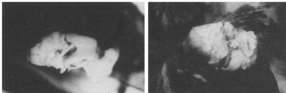
FIGURE 4. Cartilage surface of knee joints from type II collagen immunized ( right ) and control animal ( left ) at autopsy. The control joint has a smooth cartilage surface in contrast to the rough and eroded cartilage surface of the arthritis joint.

(Table I). When antibody levels to fragments of collagen were measured, there was substantial heterogeneity in the response (Table I). However, all monkeys responded strongly to cyanogen bromide peptide 11, which has previously been shown to contain an epitope arthritogenic for DBA/1 mice (6). This was in fact the only peptide with which all immune sera reacted strongly.