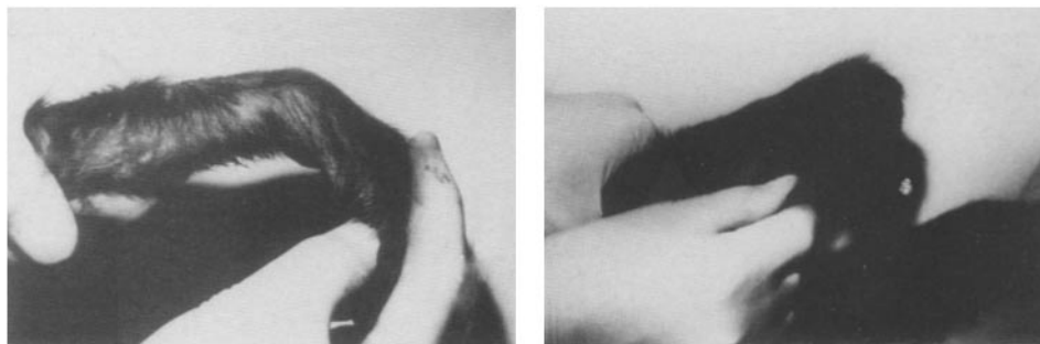
FIGURE 3. Photograph of the wrist of a monkey immunized 3 mo previously with type II collagen showing restricted flexion ( left ) the wrist of a control monkey ( right ) is shown for comparison.

Immune Response to Collagen. All of the monkeys immunized with type II collagen developed high levels of circulating antibody specific for the immunizing antigen