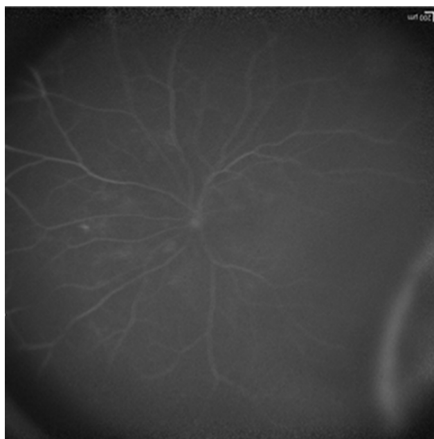
Figure 3 Ultrawidefield angiography of the left eye demonstrates irregularly staining hyperfluorescent lesion anterior to the equator in the temporal region.

crowded the angle and induced lenticular astigmatism ( -8.25 + 3.25 \times 075 ). An ultrasound showed a “mass with medium to high internal reflectivity.” The patient was offered orbital radiation to alleviate the metastasis but declined.