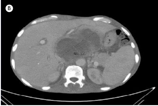
Figure 1. Computed tomography (CT) images. A - Left pulmonary apex with necrotic and abcessed tissue. B - Hepatic abcessed/nodular lesion with necrotic component.