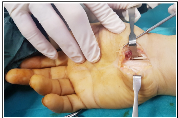
Fig.1: Image of a patient operated by the OCTR technique.

Patient Assessment: The patients were evaluated on the day before surgery and at 2 weeks, 6 weeks, 3 months, 1 year and last follow-up time after surgery. Demographic data including age, sex, hand dominance, duration of symptoms, occupation,