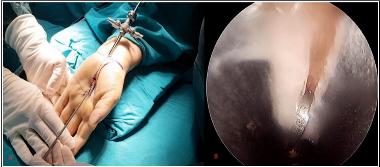
Fig.2: (A): Image of a patient operated by ECTR technique (B): Image of visualization from arthroscope.

and previous treatments were questioned and noted preoperatively. In addition, the patients completed a questionnaire that included the Boston questionnaire of the carpal tunnel syndrome-functional status score (CTS-FSS) and carpal tunnel syndrome-symptom severity score (CTS-SSS). Pillar pain was evaluated by application of direct pressure or pinching force on the thenar and hypothenar regions or leaning on a table with the patient's weight on his/her hands placed on the table's edge. Complications of the two techniques were noted and compared. The patients were questioned about return to daily life day, return to work day and satisfaction of their operation.