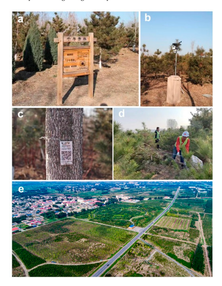
Figure 2. Exemplary landscapes, techniques, and criteria exhibited during afforestation in Xiongan New area. ( a ) The introduction of "Millennium show forest" with special emphasis on prioritizing sustainable ecological and green development. ( b ) Miniature meteorological monitoring and intelligent irrigation systems used in the "Millennium show forest". ( c ) Two-dimensional QR code, the ID card for each tree for tracking its information on species, life cycle, sources, planting time, and style, including the maintenance record from nursery to planting and management. ( d ) Measuring the height before planting a pine tree. ( e ) Aerial view of a section of planted urban forest in Xiongan New Area.

Figure 1. District map of Xiongan New Area in China. Xiongan New Area is located in the central region of "Jing-Jin-Ji" region, situated 120 km from Beijing and 110 km from Tianjin. It mainly includes Xiongxian, Anxin County and Rongcheng County with an area of 2000 km<sup>2</sup>.