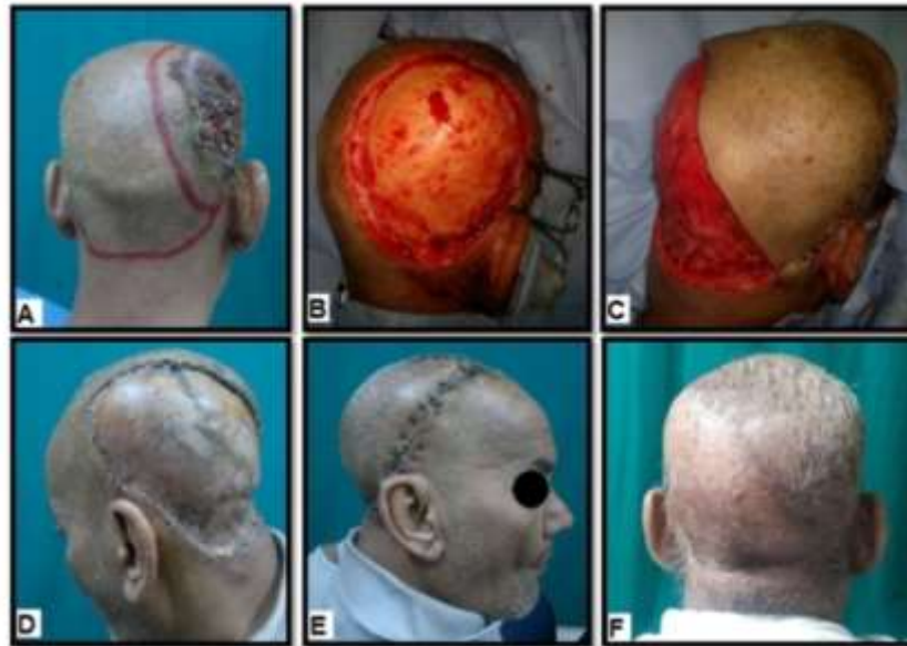
Fig. 2: A 58-year old male with BCC in the right temporo-parietal area. A) Pre-operative marking of the flap and the adequate margins of the tumor. B) Intra-operative view after the lesion was excised; the size of the defect was 154 cm 2 . C) Intra-operative view shows flap harvesting and inset. D, E) Postoperative view shows covering of the secondary defect by STSG and complete survival of the flap. F) Six months postoperative view shows good functional and esthetic outcome.