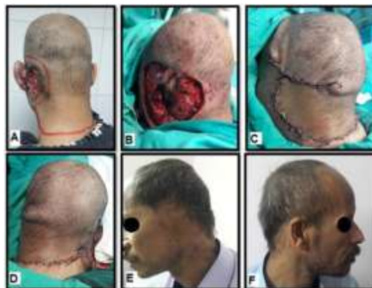
Fig. 1: A 42-year old male with BCC in the left temporo-occipital area, involving the ear. (A).Pre-operative marking of the flap and the adequate margins of the tumor. (B). Intra-operative view after the lesion was excised; the size of the defect was 140 cm 2 . (C).Intra-operative view shows flap harvesting and inseting. (D). Intra-operative view shows covering of the secondary defect by STSG. (E, F). Four months postoperative view shows good functional and esthetic outcome.

The follow-up period ranged from six to twenty-seven months (mean: 15.6 months). None of our cases had local recurrence or distant metastasis till the end of the follow-up period (Table 2).